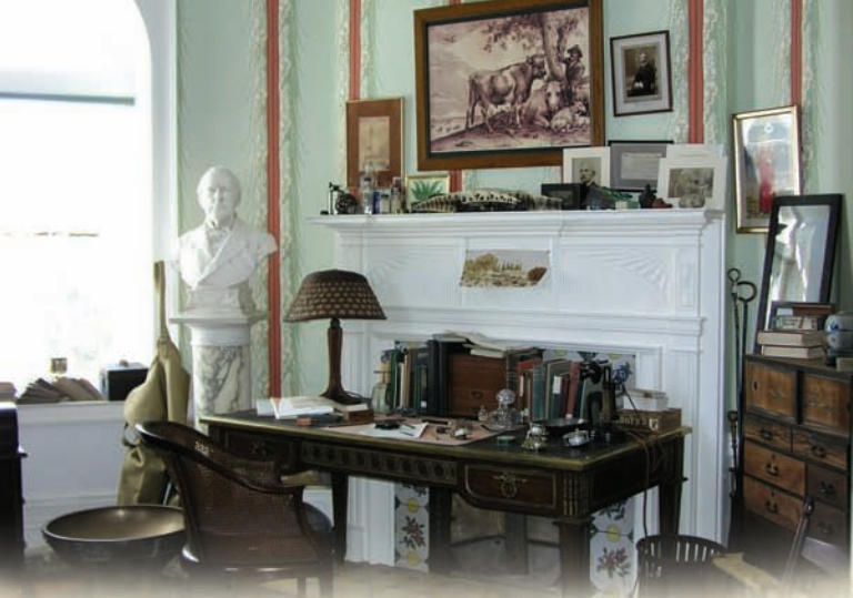
Gifford Pinchot's Office at Grey Towers.

The mission of the Grey Towers Heritage Association (GTHA) is to assist in education, improvements, promotion and conservation at Grey Towers National Historic Site, in Milford, PA.